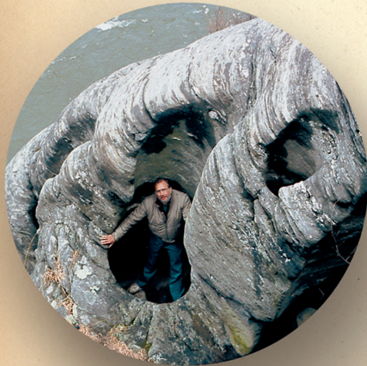
Photo of a man standing in a large bedrock island pothole.

Unlike the river's alluvial islands, which are formed from deposits of sediment, these islands consist of bedrock. They were carved by the Susquehanna's swift current as it cut into the hard schist bedrock on the river bottom.