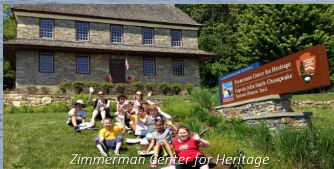
Zimmerman Center for Heritage