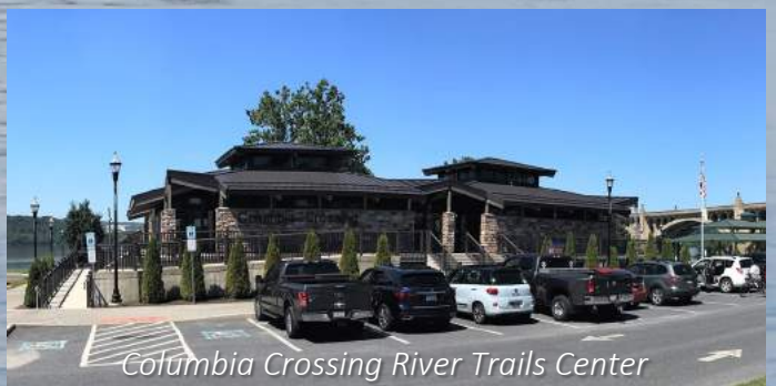
Columbia Crossing River Trails Center